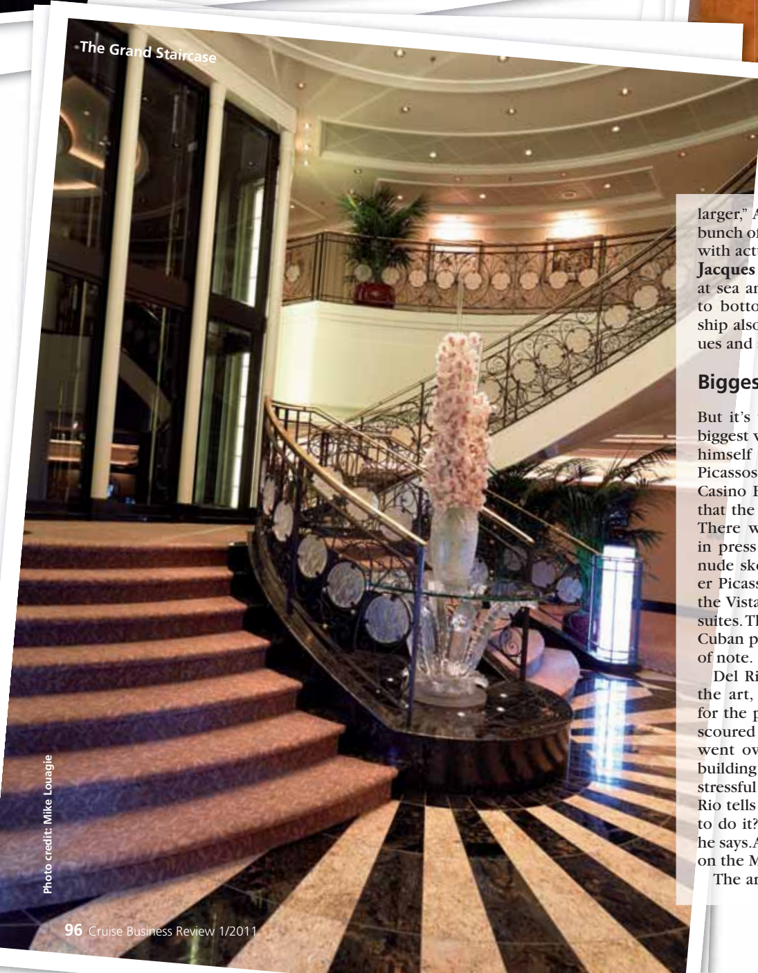
The Grand Staircase