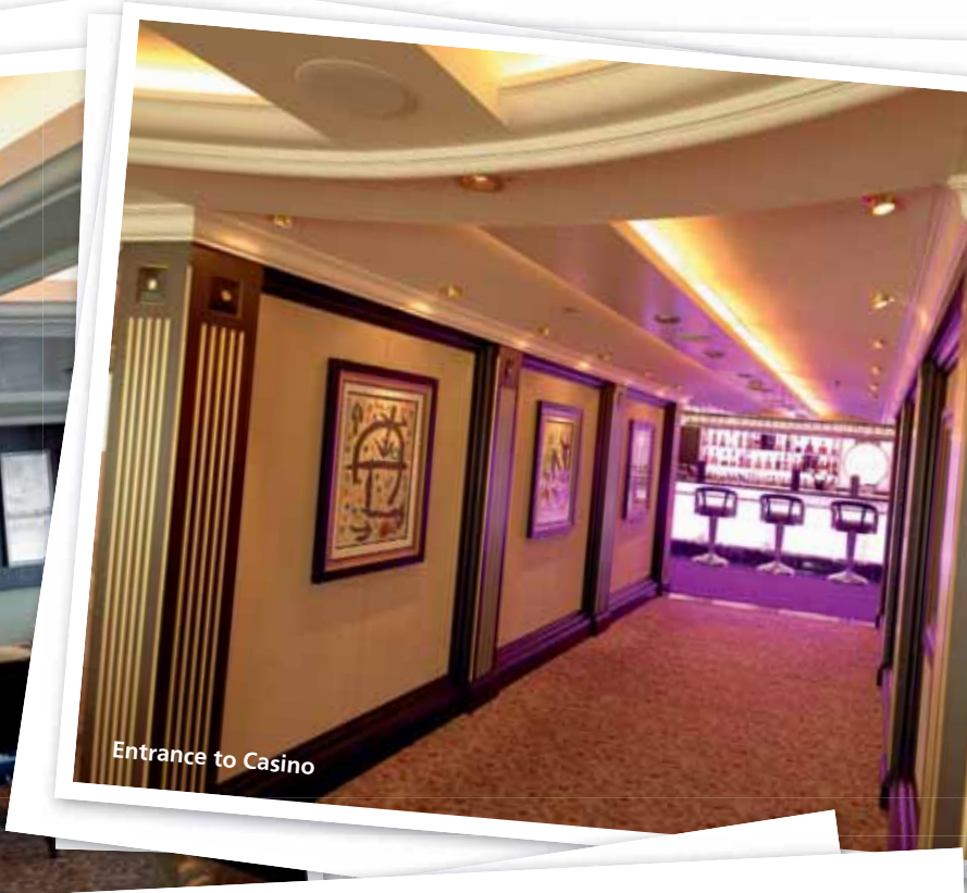
Entrance to Casino

Lyon and a rotisserie that diners can view through a kitchen window. The extensive menu is upscale French brasserie, offering everything from escargot to roast chicken. But the unexpected hit on the ship is the new Red Ginger, a contemporary pan-Asian restaurant, done up with glass bamboo walls and serving such delicious dishes as miso-glazed Chilean sea bass. As on the other Oceania ships, the Marina also offers Italian cuisine at Toscana and a classic steakhouse at Polo.