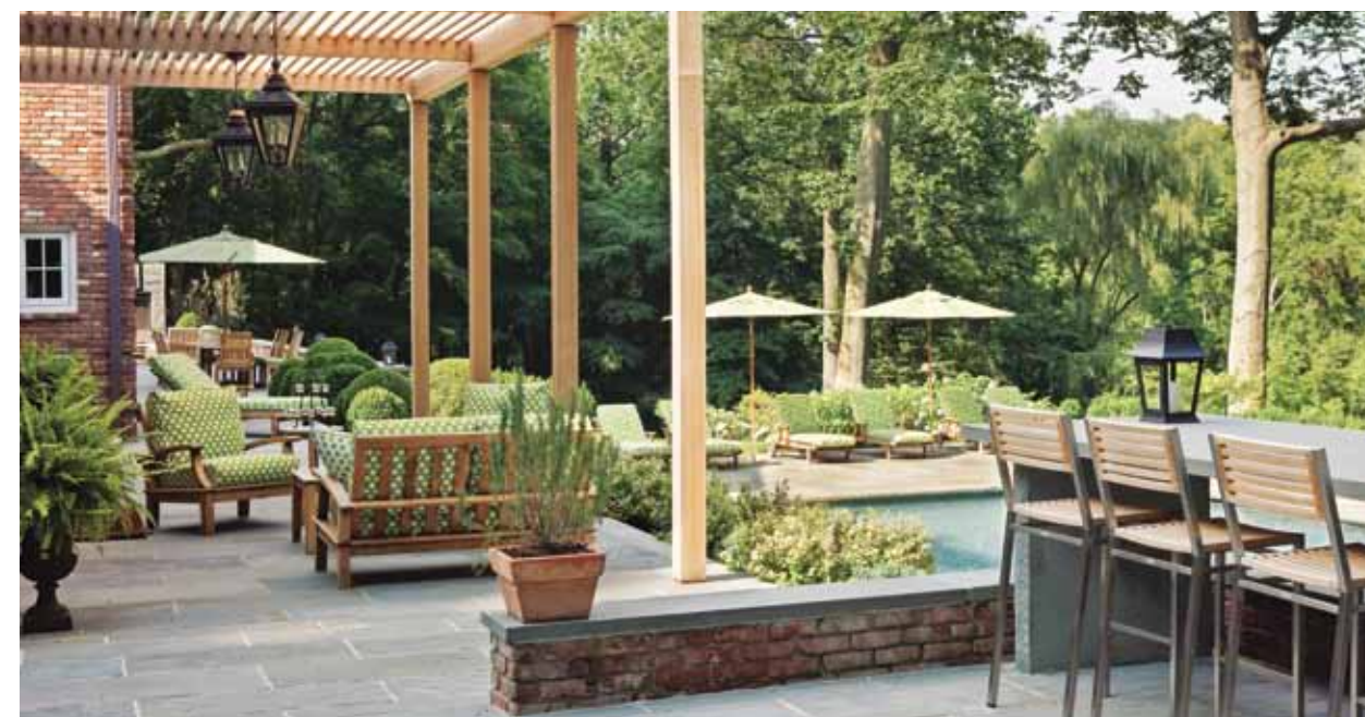
Family Time | The kitchen's open space is conducive to casual get-togethers (ABOVE). The custom counters are topped with CaesarStone; the pendant lighting is from Niche Modern and the walnut dining table is by Tocar. Looking In | The modern interiors play off the home's more traditional French Chateau-style architecture (BELOW LEFT). Easy Living | Entertaining is a breeze on the outdoor terrace just off the kitchen (LEFT). See Resources.